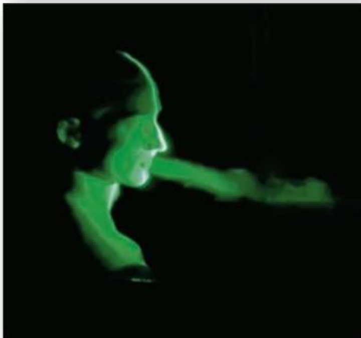
Breathing under illumination. The droplets "exhaled" by the head model become visible in the laser light. FASTCAM SA-Z high-speed camera records the intensity of the reflected light as it "exhales".