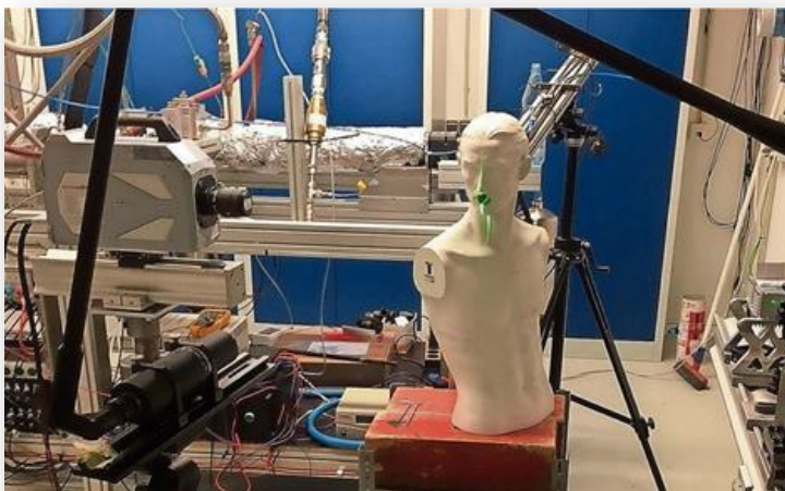
Tests with a model of a head in the laboratory for fluid mechanics. The mouth opening is illuminated by the laser light. A Photron FASTCAM SA-Z high-speed camera records the intensity of the reflected light as the head model "exhales".

Photron manufactures a wide variety of high-speed digital imaging systems. Photron high-speed cameras are used by research customers worldwide, providing reliability and high performance in the most challenging imaging applications. Their imaging products include megapixel image resolution recording at up to 21,000 frames per second (fps), four-megapixel (2K x 2K) cameras with the ability to produce high-definition 1080 HD resolution video, and ruggedized systems with miniature camera heads for on-board automotive safety testing and defense applications. In addition to providing innovative high-speed camera systems, Photron also endeavors to offer the highest quality support to its customers through experienced and trained technical staff.