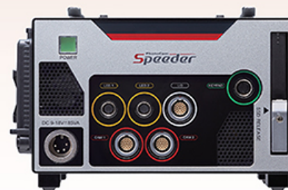
Specifications subject to change without notice

PHOTRON USA, INC. 9520 Padgett Street, Suite 110 San Diego, CA 92126-4446 USA Tel: 858.684.3555 or 800.585.2129 Fax: 858.684.3558 Email: image@photron.com www.photron.com